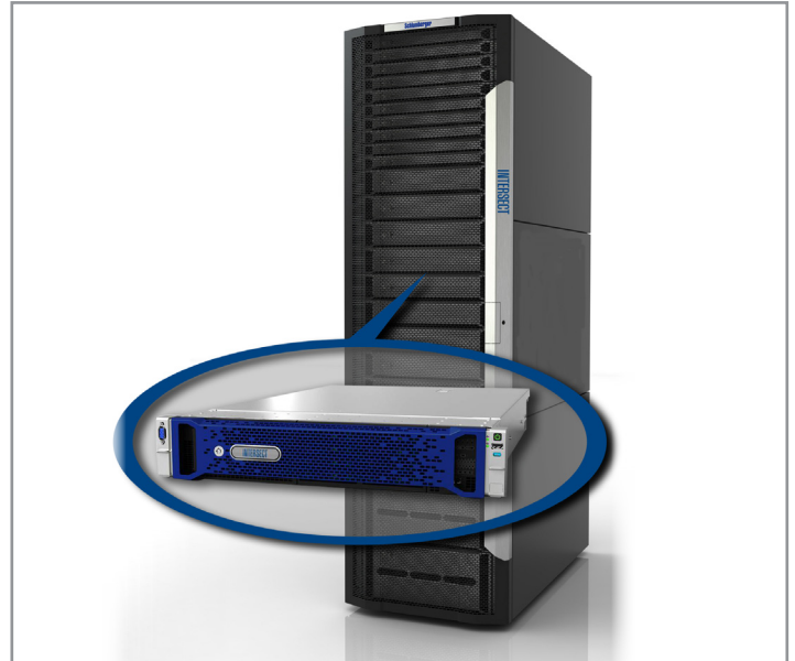
Certified configurations of HPC platforms provide optimal performance for ECLIPSE and INTERSECT software.

E-mail sisinfo@slb.com or contact your local Schlumberger representative to learn more.