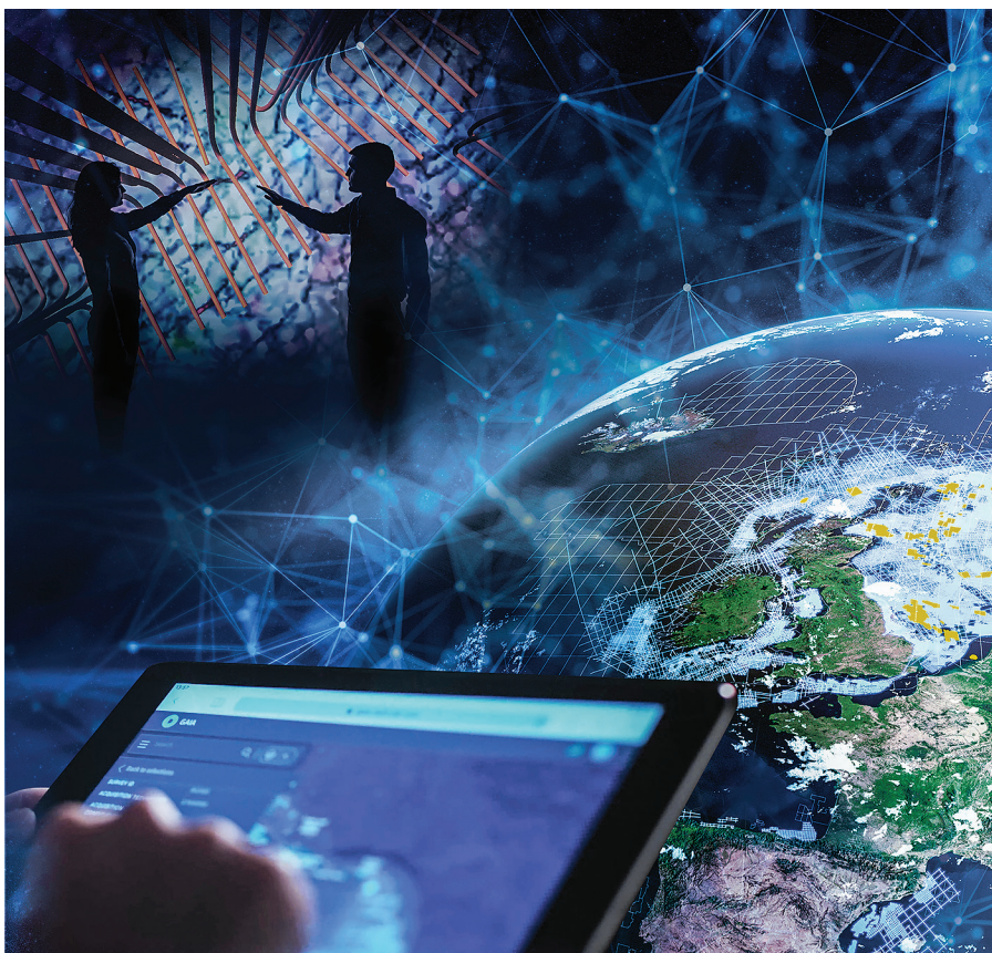
Fig. 1. The GAIA data discovery & marketplace platform is open and provides access to structured data and unstructured content, such as news and market reports, from multiple content providers across the E&P life cycle.