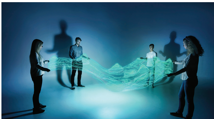
Fig. 2. Schlumberger's commitment to openness is founded on three pillars: the liberation of data and workflows, enabling customers to connect software platforms, and embracing APIs and open source code to empower customers to differentiate.

To be truly open, we must be truly inclusive. Our aim has always been to bring digital opportunities to all our customers; to everyone, no matter what size, or country they are operating in—digital transformation should not be reserved only for those who have access to global clouds.